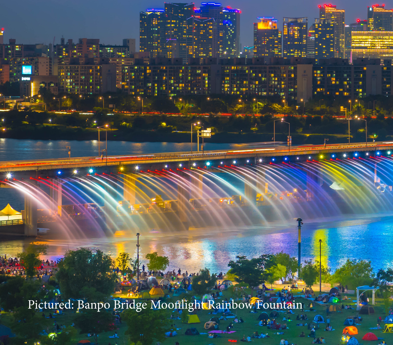
Pictured: Banpo Bridge Moonlight Rainbow Fountain

While traveling around Seoul, there are many neighborhoods and towns that have many places you can visit to shop, eat, and explore. From visiting museums and exhibitions, trying new cultural food at restaurants and cafes, to shopping at malls and on the streets, these towns have so much to offer for foreigners, families, and friends.