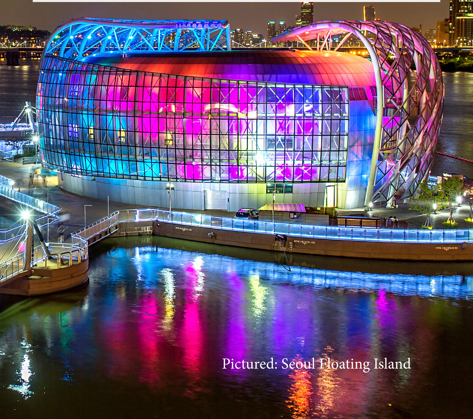
Pictured: Seoul Floating Island