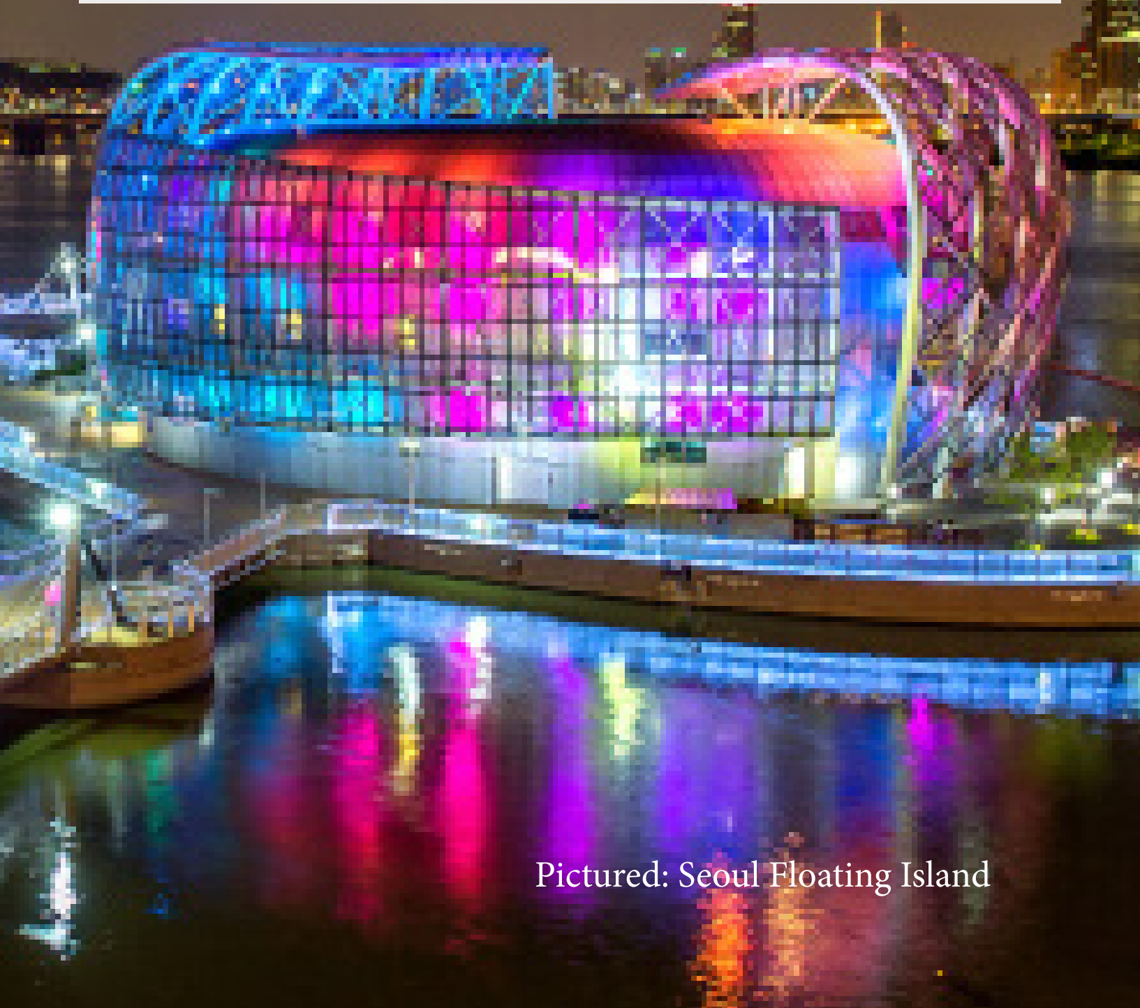
Pictured: Seoul Floating Island